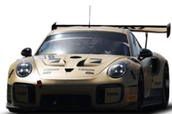
Porsche 992 & 911 GT3 Cup