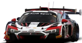
Audi R8 LMS GT2