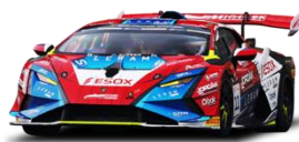
Lamborghini Huracan Super Trofeo EVO2

GT2 homologated and invitational cars compete for the same classification and follow the same Balance of Performance process .